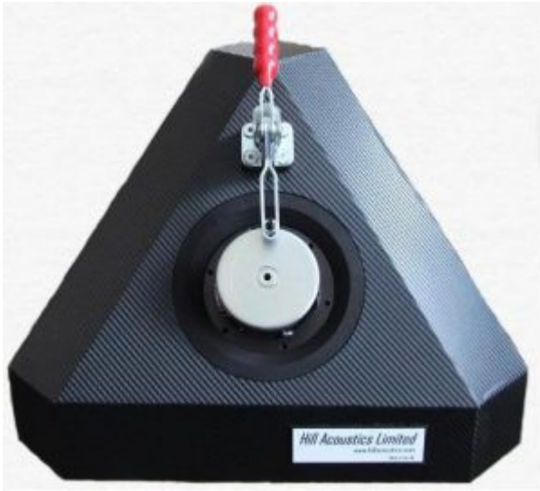
Tetrahedral Test System for Loudspeaker Testing, by Hill Acoustics Limited. (Click image to enlarge)

While building one box is a manageable task, problems often start when it comes to building more than one comparable test jigs. It is recommended to accurately document all measures, materials and building processes, as even minor variations can produce measurable differences in the acoustic results.