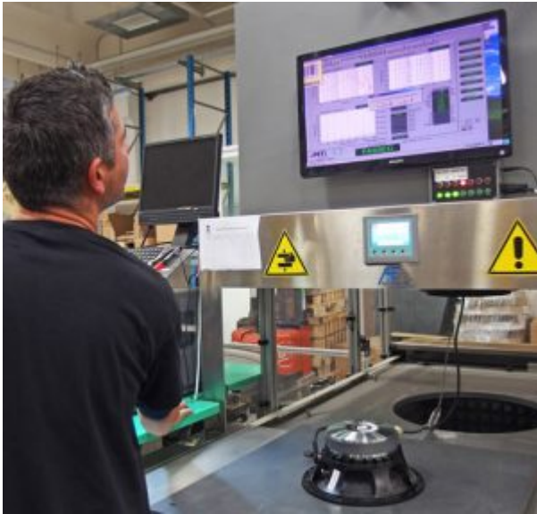
A factory worker at Eighteen Sound during the QC Stage. (Click image to enlarge)

Typical measurement functions, for example in a passive loudspeaker end-of-line test, are frequency response, impedance response, harmonic distortions in various configurations, sound pressure levels at different frequency bands, resonance frequency, Thiele/Small parameters, speaker polarity, and, of course, a Rub & Buzz measurement.